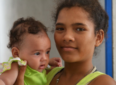
Top-10 Unmet Needs in Sexual and Reproductive Health of Venezuelan Migrants in four Colombian cities with important migration flows, 2019.